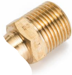
¼" MNPT Fitting

A heavy-duty vacuum / autoclave hose with stainless steel braided jacket over PTFE liner over a convoluted metal bracing with 2x ¼" MNPT brass straight male fittings with 10' length (HS11012) standard. Custom fittings and lengths available for made to order.